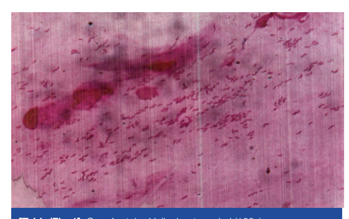
[Table/Fig-1]: Gram's stain- Helicobacter pylori (100x)

In duodenal ulcer, gastric ulcer and gastroduodenitis, 68.88%, 57.14% and 38.09% were positive for H. pylori respectively.